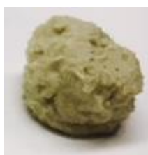
Sericite made in M