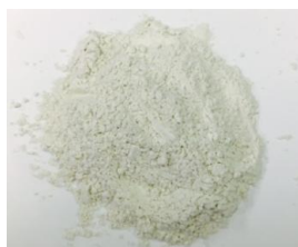
Sericite made in M (Whiteness around 72)