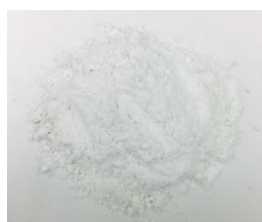
SERICITE LQ-15 (Whiteness around 92)