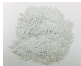
Sericite made in T (Whiteness around 75)