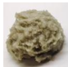
Sericite made in T

●Especially in oil absorption test, there are color difference between LQ-15 and oversea's 2 items.